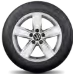
"Corvara", 15-inch Brilliant Silver