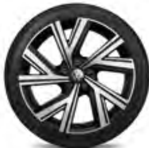
"Bergamo", 17-inch Black, diamond-turned