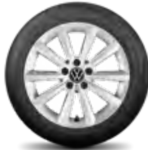
"Merano", 16-inch Brilliant Silver