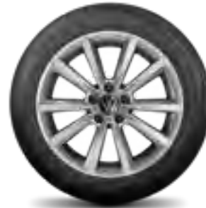
"Merano", 16-inch Adamantium Dark Metallic

Further accessories for your wheels, including valve caps, wheel bolt locking sets, tyre bag sets and snow chains, can be found in the universal accessories section on page 53.