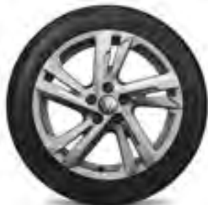
"Valencia", 16-inch Grey Metallic