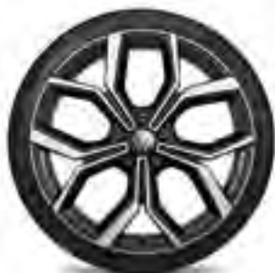
"Faro" GTI, 18-inch Black, diamond-turned